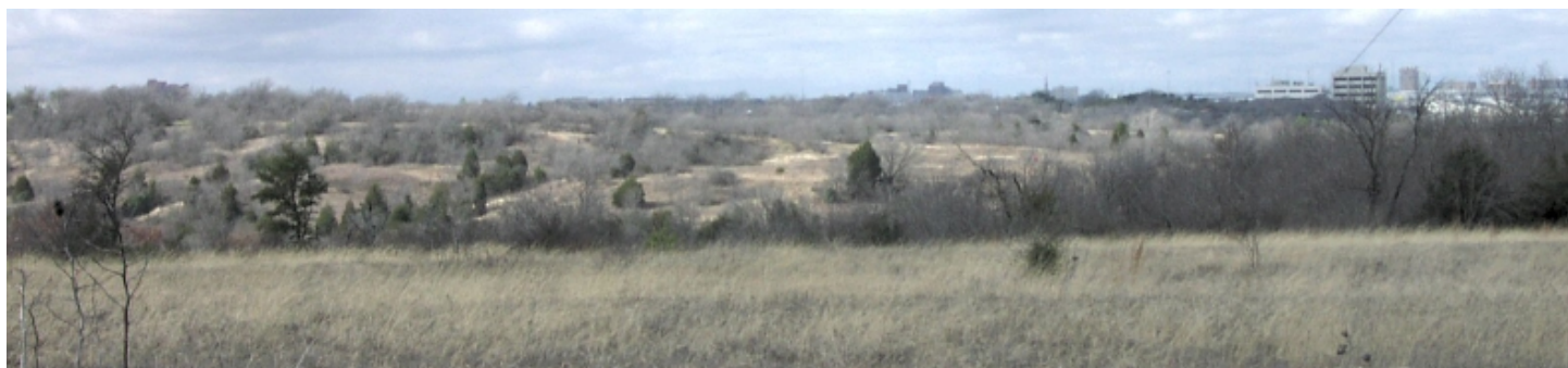
A SCENIC VIEW OF BEAUTIFUL TANDY HILLS PARK