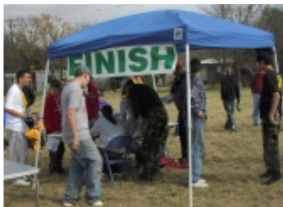
THE FINISH TENT