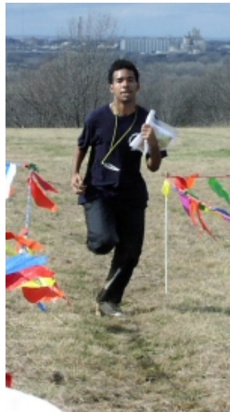
A BIG EFFORT ON THE "RUN IN"