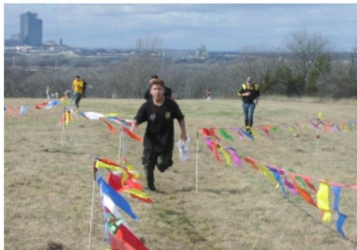
A CROWD APPROACHES THE FINISH LINE