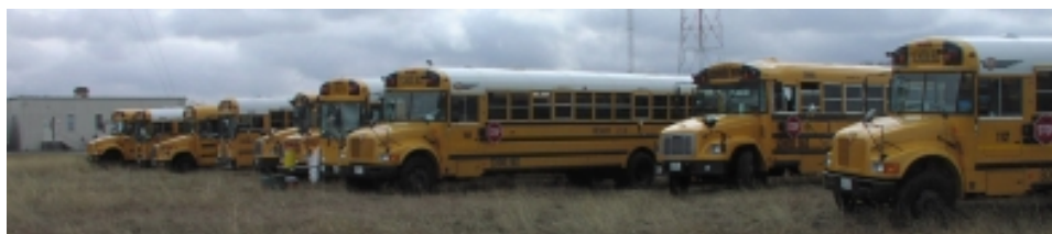
TWELVE SCHOOLS ATTENDED THE MEET!