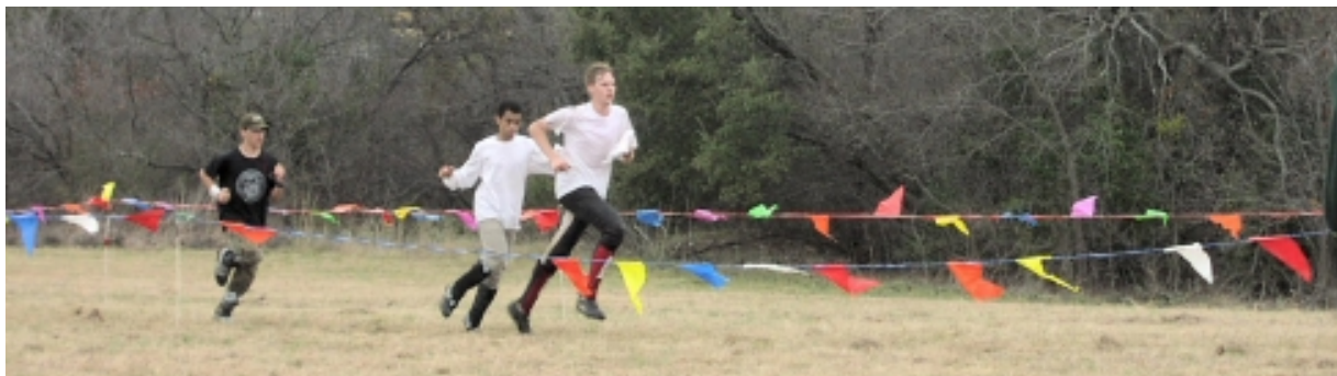
RACING IN THE FINISH CHUTE