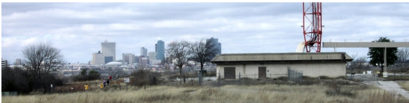
FROM THE TOWER AREA, TANDY GIVES A WONDERFUL VIEW OF DOWNTOWN FT WORTH